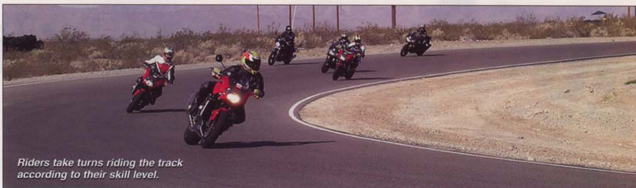
Riders take turns riding the track according to their skill level.